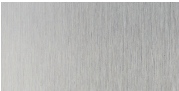
GM437 #4 Brushed