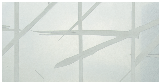
Stainless Steel design shown approximately 75%