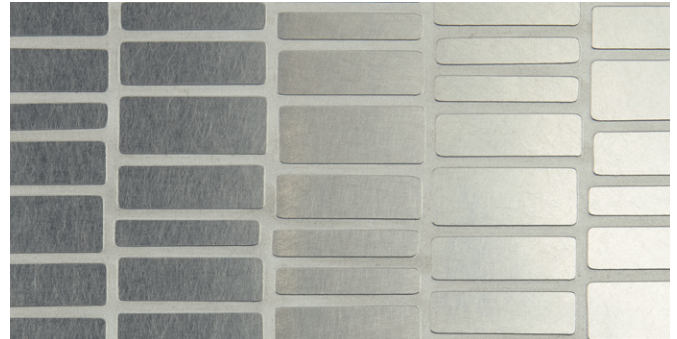
Stainless Steel design shown 1:1