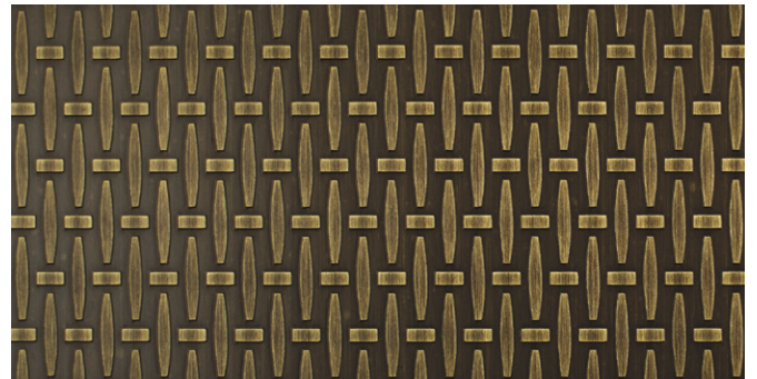
Patinated Muntz design shown 1:1